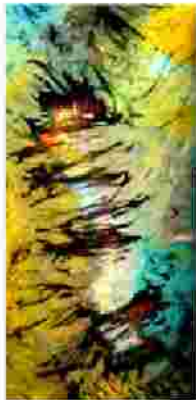
Krise (crisis) 120x100cm, 2009 Seide auf Leinwand (silk on canvas)