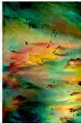
Neue Ideen (new ideas) 120x80cm, 2009 Seide auf Leinwand (silk on canvas)