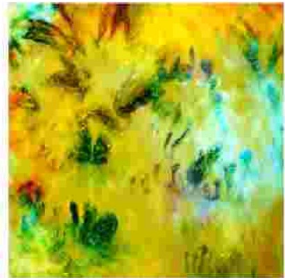
Anacrusis (anacrusis) 100x150cm, 2009 Seide auf Leinwand (silk on canvas)