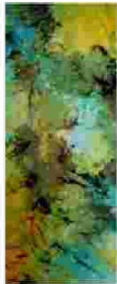
Ungewisse Zukunft (uncertain future) 100x150cm, 2009 Seide auf Leinwand (silk on canvas)